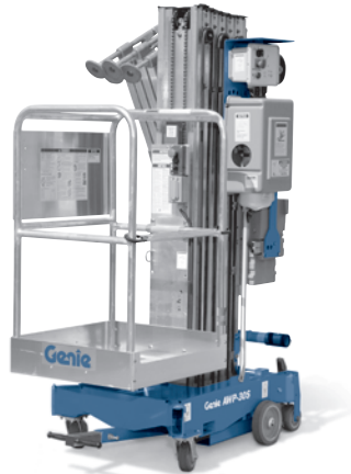
(1) Available aftermarket only (2) Factory-fit option only.